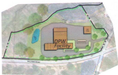
Conceptual Site Plan