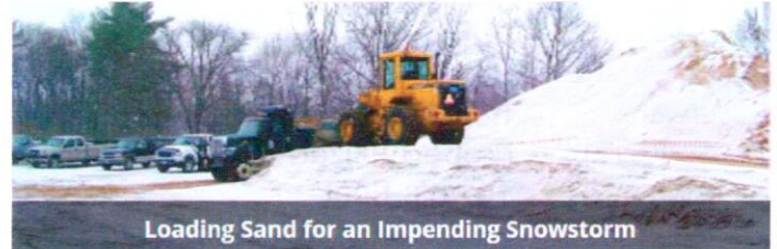
Loading Sand for an Impending Snowstorm