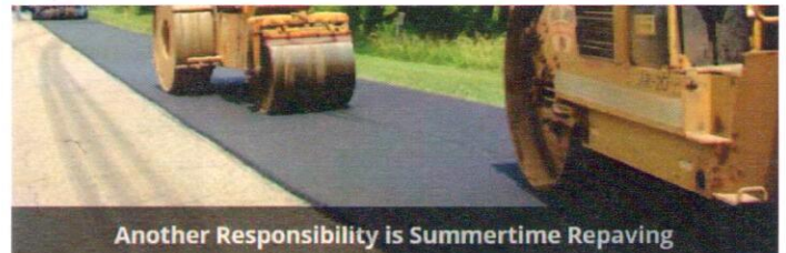
Another Responsibility is Summertime Repaving