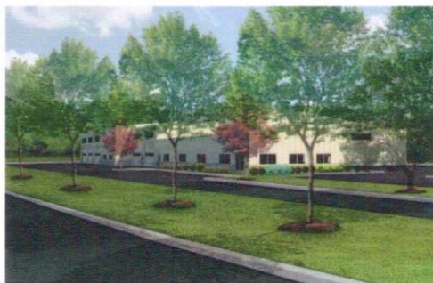
Rendering of Proposed Building & Site