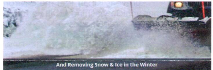
And Removing Snow & Ice in the Winter