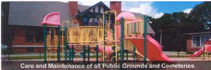
Care and Maintenance of all Public Grounds and Cemeteries